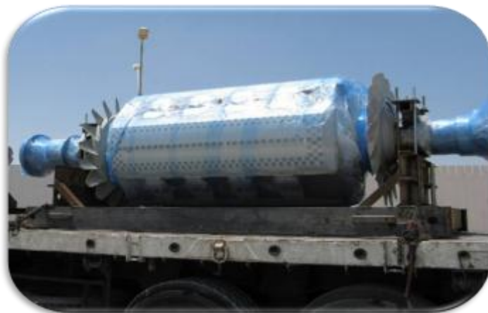
Generator engine (30 ton)