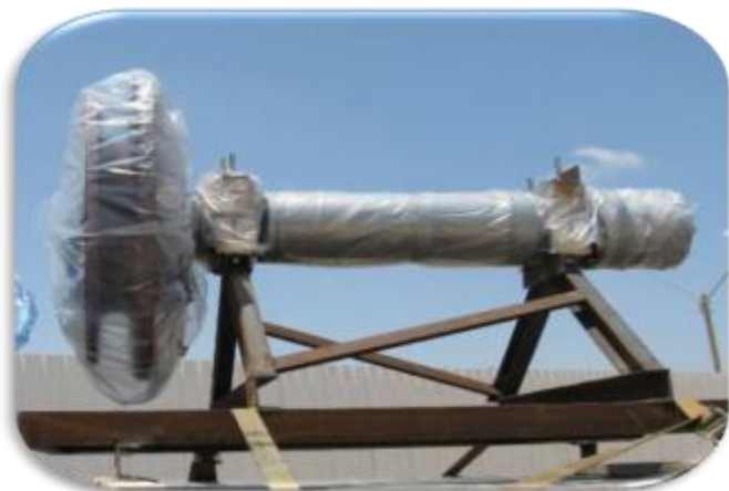
Turbine engine (1 ton)